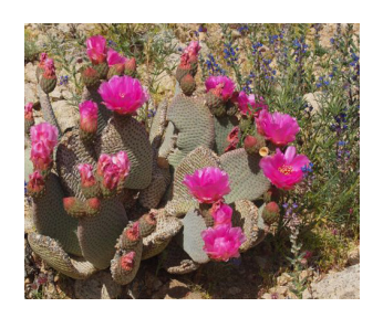
Opuntia basilaris in bloom

Beavertail Prickly Pear ( Opuntia basilaris ): This cactus is found in Coconino, La Paz, Maricopa, Mohave, Yavapai and Yuma Counties in Arizona. It grows at elevations of from sea level to up to 8,000 feet. The pads are blue-grey in color with tan or redish-brown spines. Beavertail bloom in the spring with a large dark-pink to light pink-flowers.