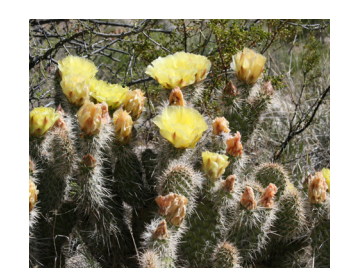
Opuntia erinacea in bloom

Mojave Prickly Pear ( Opuntia erinacea ): This cactus is found in Mohave and Coconino Counties in Arizona. It grows at elevations of 3,500 to over 8,000 feet. The pads are oval with long, hair-like spines the vary in length. The flowers bloom in spring ranging in color from yellow to dark pink. Mature Mojave Prickly Pear fruit are dry becoming a spiny burr.