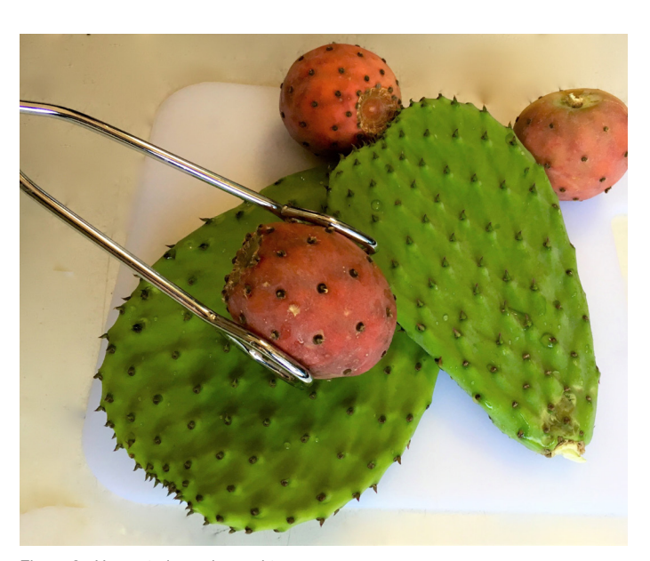
Figure 2: Harvested nopales and tunas.

Use thick leather gloves when harvesting cactus pads because their spines and glochids will penetrate skin easily. Next, identify the pad you would like to remove. It should be firm and without blemishes. Then, hold the top of the pad gently in one hand and cut the pad from its supporting pad with a sharp knife. It is recommended to harvest prickly pear pads in the mid-morning hours when acid content is at its lowest.