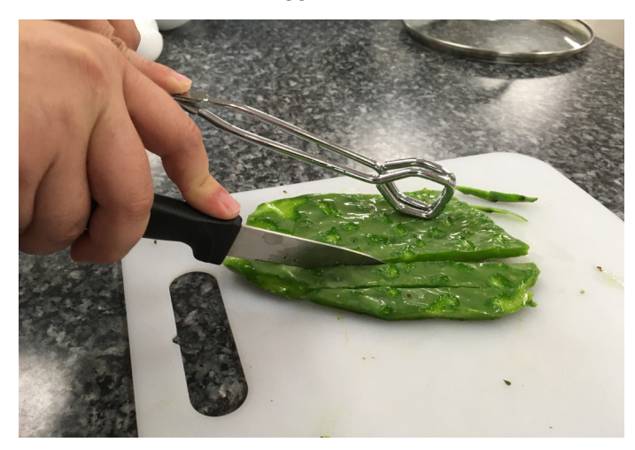
Cut nopales into 1/4 inch strips.