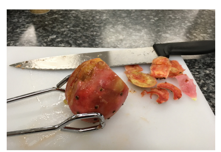
Clean fruit and remove damaged spots.