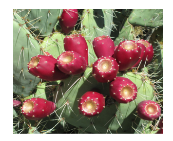
Opuntia engelmannii with fruit

Englemann Prickly Pear (Opuntia engelmannii): This cactus is found in Cochise, Coconino, Gila, Graham, Greenlee, La Paz, Maricopa, Mohave, Navajo, Pima, Pinal, Santa Cruz, Yavapai and Yuma Counties in Arizona. It grows in elevations of 1,000 to 8,000 feet. Englemann Prickly Pear have widely spaced white to yellow spines. The yellow to orange color flowers bloom in spring. The fruits are deep red to purple in color.