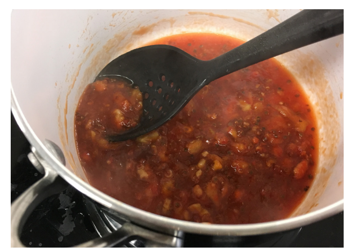
Cook and mash fruit.