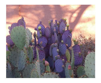
Opuntia santa-rita with distinct purple-coloring

Santa Rita Prickly Pear ( Opuntia santa-rita ): This cactus is found Cochise, Pima and Santa Cruz Counties in Arizona. This cactus grows at elevations of 2,000-5,300 feet. The pads for this cactus are round with bluish-gray to purple color. The yellow flowers bloom in spring. The fruit on the Santa Rita Prickly Pear are relatively small and reddish purple in color.