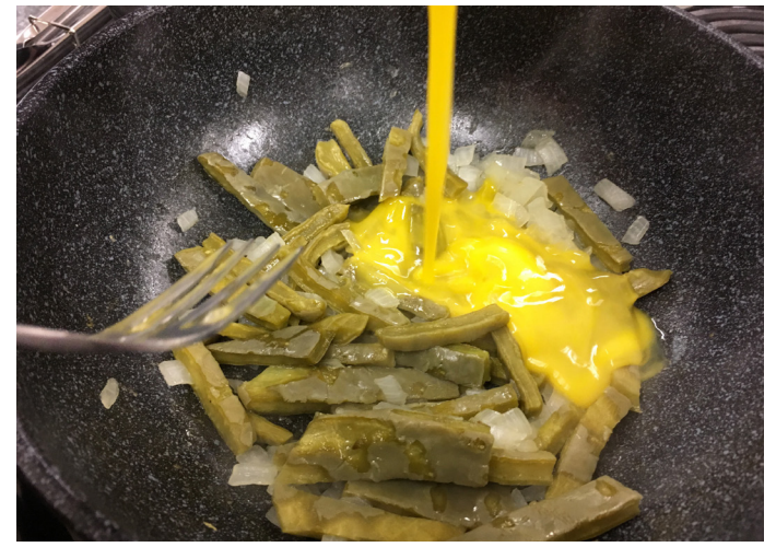
Add eggs and cook.