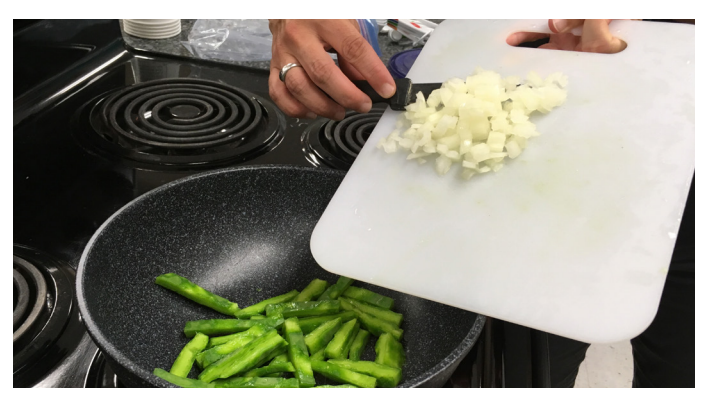
Add onion and salt.