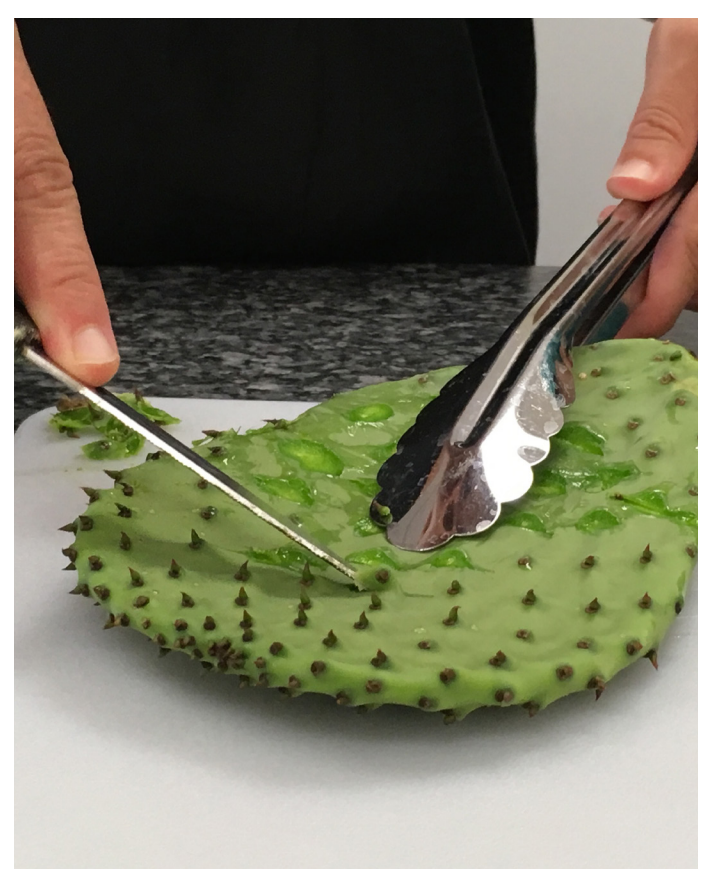
Figure 3: Removing the "eye" with the tip of the knife and tongs.

Nopales have a versatile flavor and texture and are often compared to asparagus, okra, or French beans. They can be used in a variety of ways including: eaten raw or sautéed or steamed and added to soups, stews, salads, and egg dishes. Nopales are generally sold fresh with their spines removed, but they are also available canned and pickled, allowing these vegetables to be available all year round.<sup>8</sup>