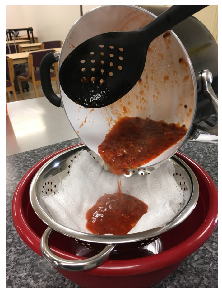
Strain cooked, mashed fruit.