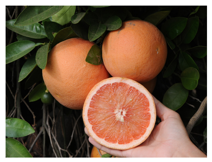
Figure 5. 'Rio Red' grapefruit.

Star Ruby (Fig. 7) was developed by irradiating seed of the seedy, but intensely red colored 'Hudson' grapefruit, which itself is a bud mutation of the 'Foster' (See the subsequent publication <u>Mandarins for Southern Arizona</u> for an explanation of irradiation – a common practice in