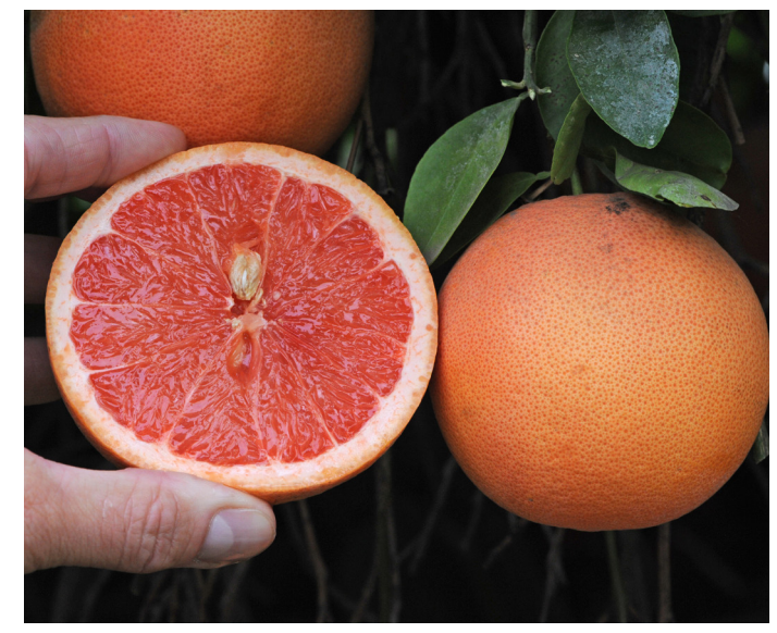
Figure 7. 'Star Ruby' Grapefruit.