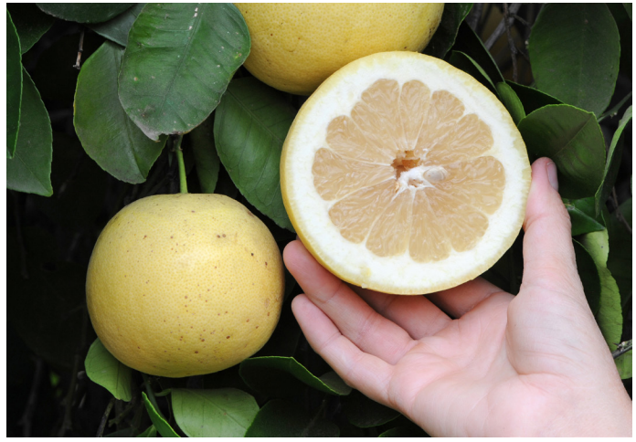
Figure 10. 'Oroblanco' pummelo hybrid.

'Cocktail' (Fig. 12) is a hybrid of a 'Siamese Sweet' pummelo and a 'Frua' mandarin. The cross was made at the University of