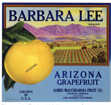
Figure 1. Early 1900's grapefruit crate label from Arizona.

Because of their shape and size, pummelos are often confused with grapefruit, because grapefruit is a pummelo hybrid and because there are also several cultivars of "grapefruit" that are instead hybrids between pummelo and grapefruit or pummelo and mandarin that still do resemble grapefruit. In this publication, the term "pummelo hybrid" refers to fruits