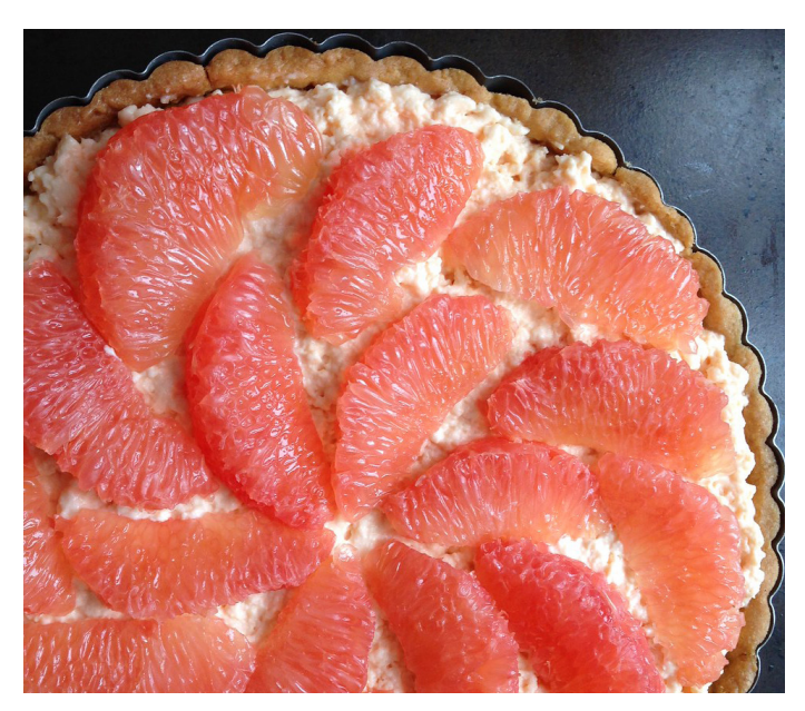
Figure 18. Hugo and Victor's pink grapefruit tart.