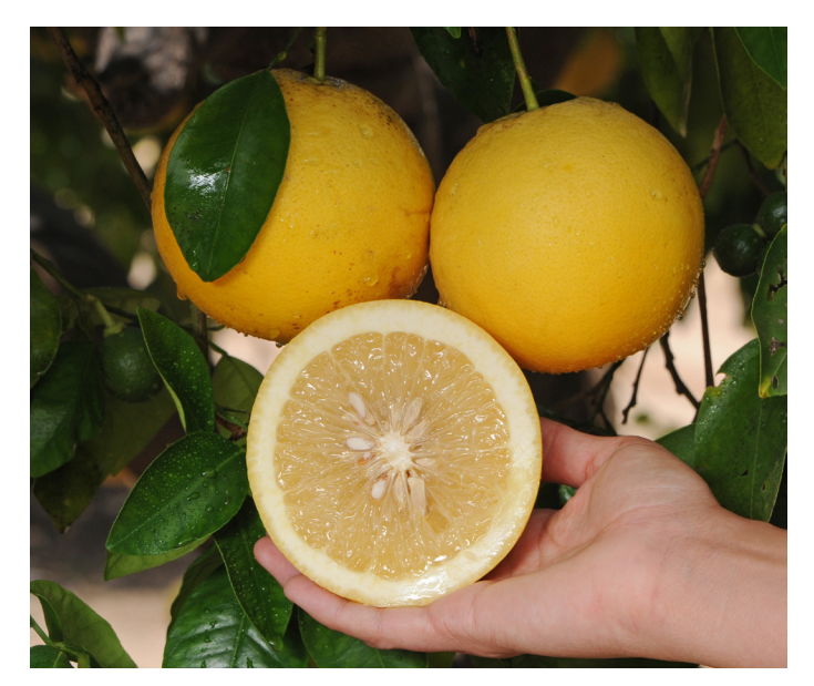
Figure 2. Duncan grapefruit.

Redblush' (Fig. 4) appeared as a spontaneous bud mutation of 'Thompson', in 1931 in McAllen, Texas. 'Ruby Red' was another mutation from 'Thompson' that appeared in McAllen in 1929<sup>14</sup>. Both have darker coloration