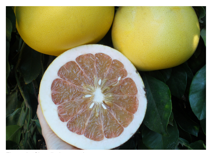
Figure 8. 'Chandler' pummelo.