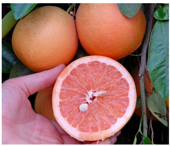
Figure 6. 'Flame' grapefruit