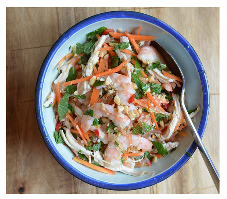
Figure 17. Vietnamese pummelo salad.