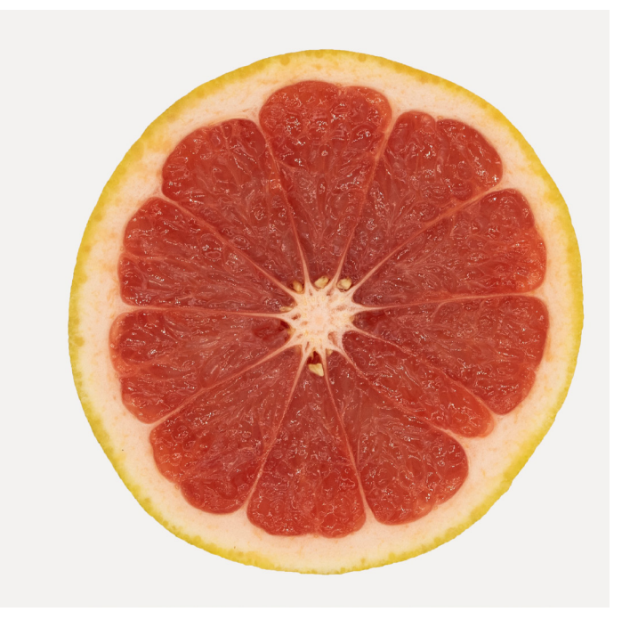
Figure 15. '914' grapefruit pummelo hybrid.

Fortunately, citrus breeders are developing cultivars of grapefruit and pummelo with lower levels of furanocoumarins<sup>31</sup>. One of these is '914', a patented grapefruit pummelo hybrid that is being developed at the University of Florida (Fig. 15). Trees of '914' are being distributed to Florida citrus growers for testing. Expect to see a grapefruit such as these at the supermarket within the next 5 to 10 years