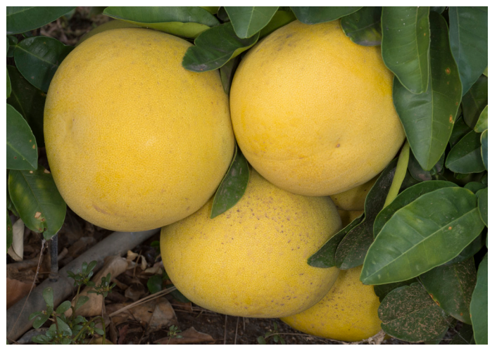
Figure 9. 'Sarawak' pummelo

Trees of 'Sarawak' are medium-sized but with drooping branches. Fruits are borne in clusters, as with a grapefruit, and are usually smaller than a typical pummelo, but still larger than a grapefruit. 'Sarawak' fruits are round with a slightly flattened bottom and a greenish-yellow rind. The rind is thicker than a grapefruit, but still thinner than a typical pummelo. 'Sarawak' pummelos have at least 20 seeds. The flesh is greenish-yellow and highly juicy. Flavor at maturity is sweet, and slightly tart that reminds the eater of melons or limes. 'Sarawak' pummelos do not seem to be subject to granulation.