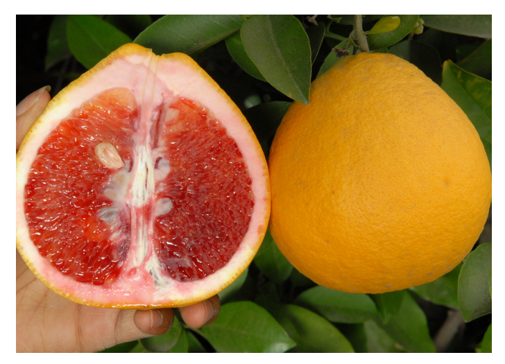
Figure 13. 'Valentine' pummelo hybrid.

Dragon (a dwarfing rootstock) and Trifoliate orange seem to be more suitable in heavy clay or silt soil, rather than in sandy or gravelly soils unless amended with organic matter. High soil and water pH, common to Arizona, lead to nutrient deficiencies for trees budded to Flying Dragon and trifoliate orange. The author has seen grapefruit trees budded to Volkameriana rootstock which will produce a large tree with heavy yield of acceptable fruit. The author does not recommend purchasing pummelo trees on Volkameriana or Macrophylla rootstocks, as these will produce vigorous trees but with serious problems with granulation.