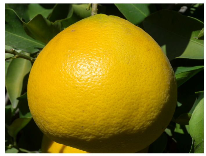
Figure 12. 'Cocktail' pummelo hybrid.

All grapefruit and pummelo trees are grown on a rootstock. A rootstock is another citrus cultivar that the grapefruit or pummelo tree is budded to in the nursery. Rootstocks generally improves growth, fruit quality or disease resistance of the tree. If you look carefully at the trunk, you will often see an area where the bark changes texture or where the trunk increases in circumference. Below that area is the rootstock and above it is the grapefruit or pummelo tree. Choosing the proper rootstock is vital when growing grapefruit or pummelo in the desert, but it is often difficult to know which one is used. Sometimes the rootstock name is found on a tag tied to the branch or wrapped around the trunk. Occasionally it is found on a sticker on the pot. The best rootstocks for grapefruit and pummelo in Arizona (in no particular order) are as follows: Sour orange, Smooth Flat Seville, Carrizo Citrange and C-35 Citrange. Flying