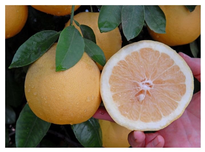
Figure 3. 'Marsh' grapefruit.