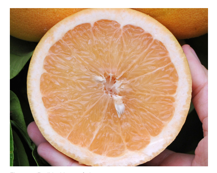
Figure 4. 'Redblush' grapefruit.