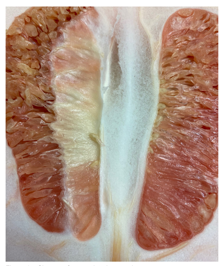
Figure 14. Closeup of a granulated pummelo.

Granulation also appears to be worse in citrus grown on sandy and gravelly soils rather than on heavier soils. There are certain things that one can to lessen the chance of granulation.