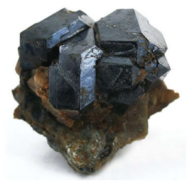
Figure 1. Uraninite Crystals: The most common uranium mineral. Formerly known as pitchblende, this mineral has radioactive uranium that decays to form radon gas and other radioactive elements .

Uranium is everywhere in soil and rocks as there are more than a dozen uranium minerals (Geology.com 2019), see Fig. 1. There are areas of Arizona with abnormally high concentrations of uranium (Spencer et al. 1993), which can produce high concentrations of radon gas in soils, sediments, and groundwater.