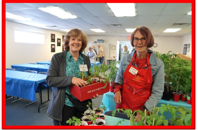
Tomato plant fundraiser grown by Master Gardeners and sold to Master Gardeners & their friends