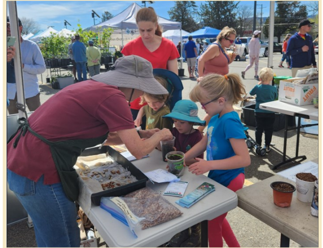
Prescott Farmers Market Earth Day event, April, 2023