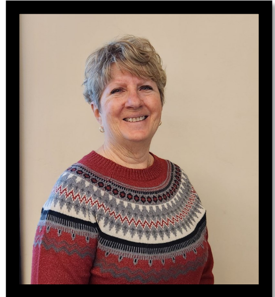
PAM EDWARDS - PRESIDENT-ELECT