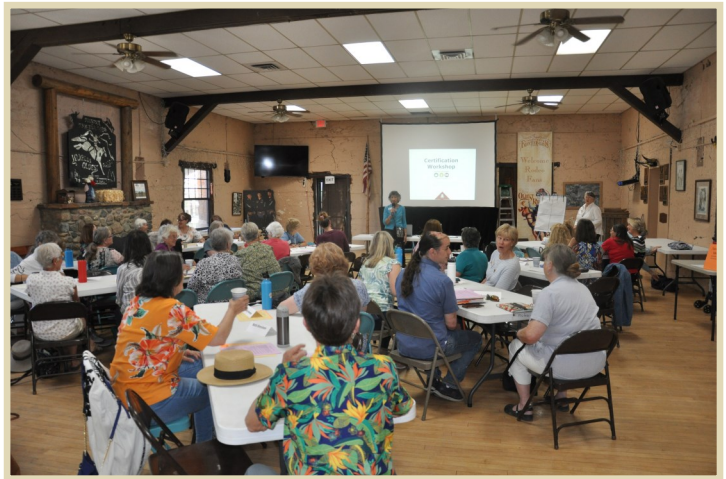
MG Welcome & Certification Workshop May 2023