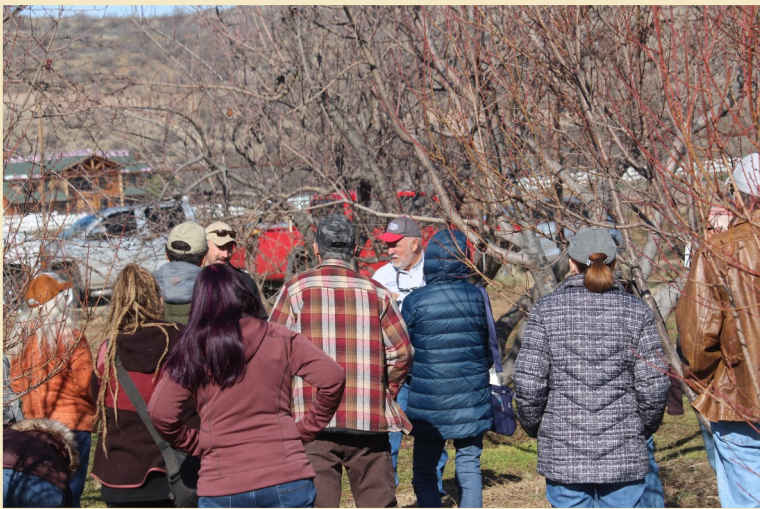
Camp Verde Fruit Tree Pruning - February 2023