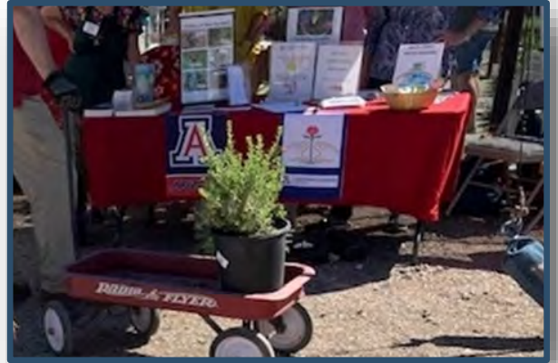
A Day in the Garden at Verde River Growers, Cottonwood – Information table